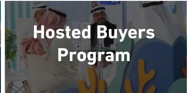
Hosted Buyers Program